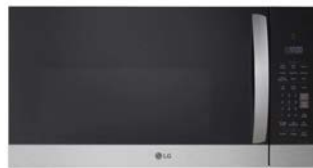
MVEM1721F 1.7 cu. ft. Over-the-Range Microwave Oven